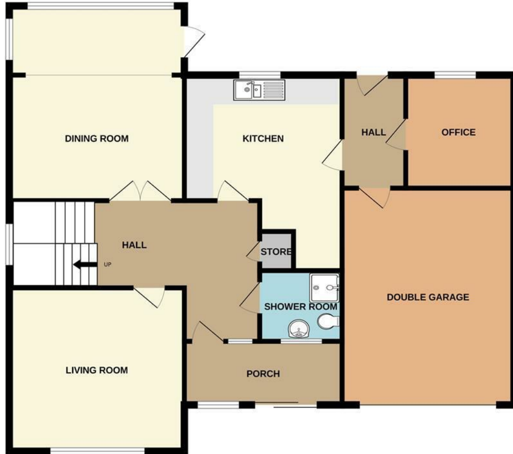
GROUND FLOOR 1192 sq.ft. (110.8 sq.m.) approx.